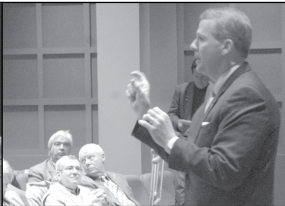
Rep. Gresham Barrett