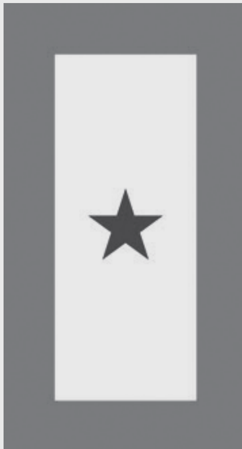
Blue Star Mothers Service Flag