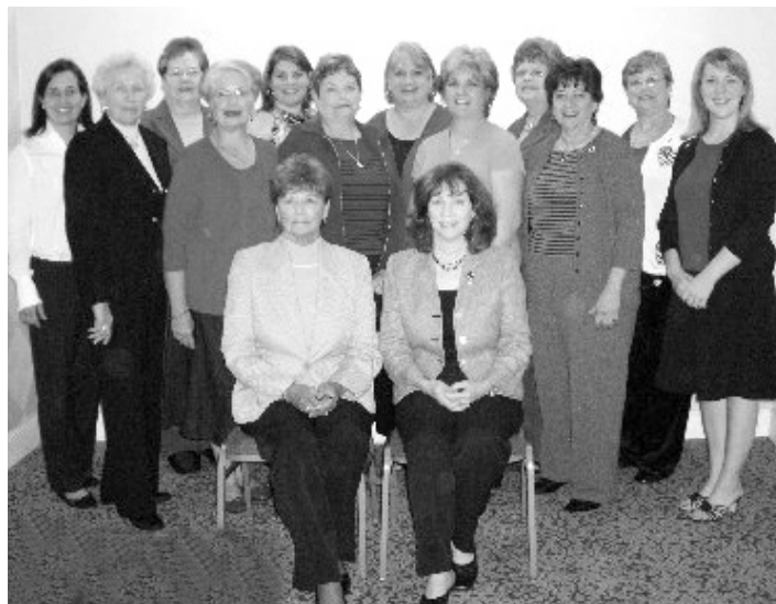
Greenville County Republican Women at convention